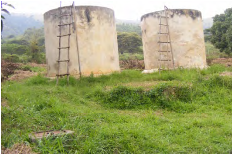
Primary Kyabirikwa Water Storage Tanks