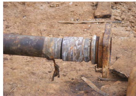
Leaking, patched water pipe