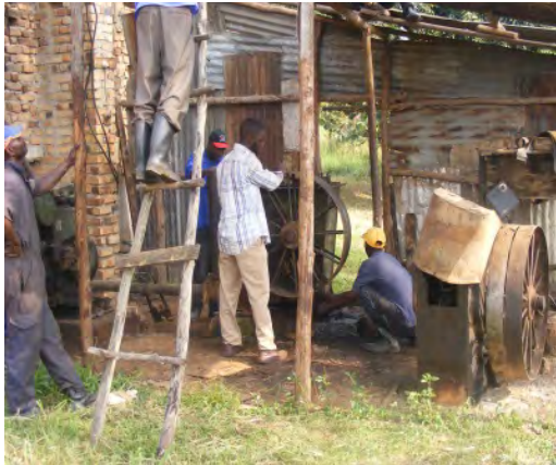
Disassembling the Pump House