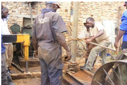
Pulling 190 ft deep water pipe