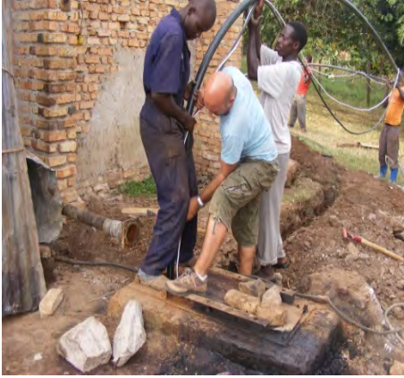
Gunfos In-line water pump installed