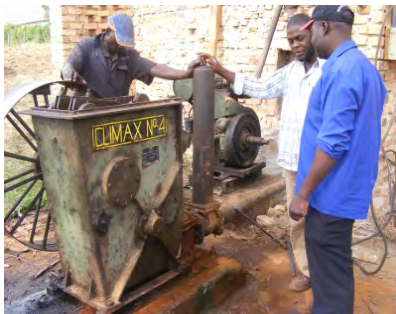
Removing the 54 year old pump?