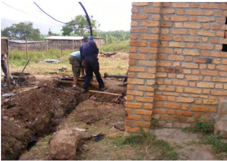
New Distribution line to water tanks