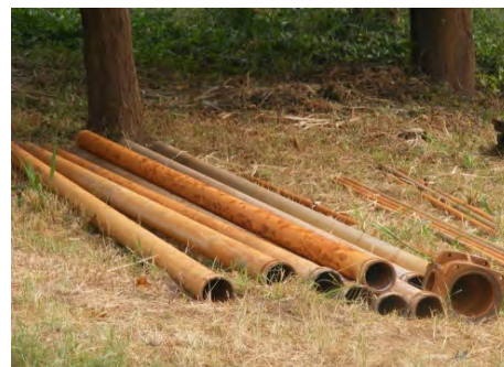
Badly corroded water pipe replaced