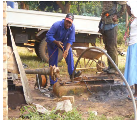
24 hr pump-down well capacity test